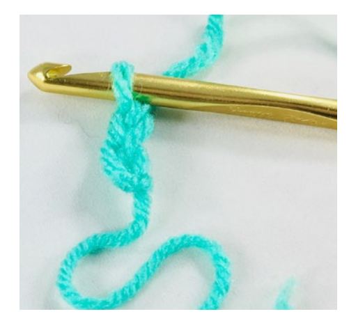
Row 1: Single crochet (sc) in second chain (ch) from hook.