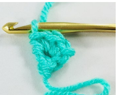
Row 2: Ch 1, turn, make 3 sc in the sc of Row 1 - you will have 3 sc in this row.