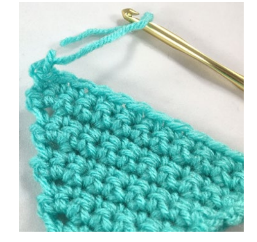
Repeat all of the previous steps to make more triangular flags.