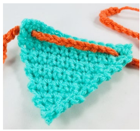
Using yarn needle, weave in yarn tails.